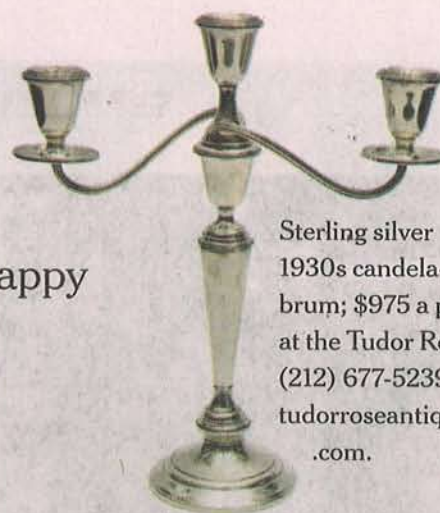
Sterling silver 1930s candelabrum; $975 a pair at the Tudor Rose, (212) 677-5239, tudorroseantiques.com.

Battery-run LED candles; $15 to $39 at Restoration Hardware, (800) 910-9836, restorationhardware.com.