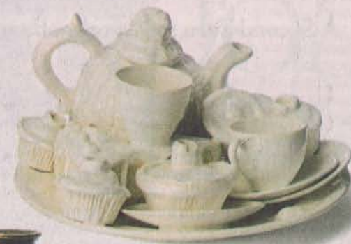
Earthenware Tea Party candelabrum with openings to hold five candles; $398 at Anthropologie, (800) 309-2500, anthropologie.com.