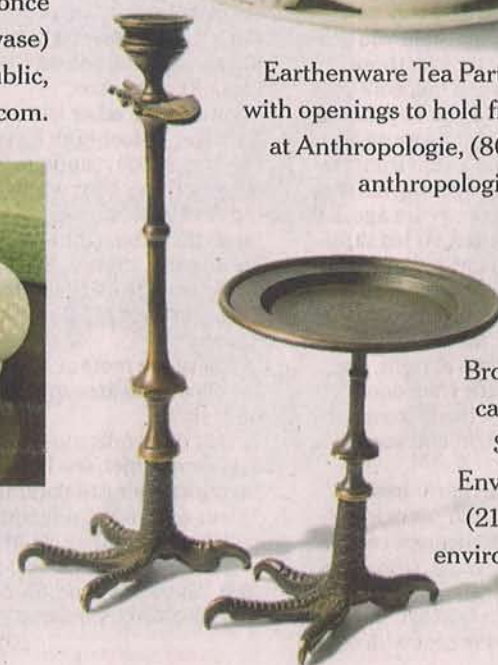
Bronze claw-foot candleholders; $70 each at Environment 337, (212) 254-3400, environment337.com.