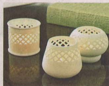
Bisque porcelain lattice tea light holders; $24.99 for three at Pottery Barn, (888) 779-5176, potterybarn.com.