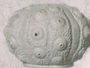
Perforated bone-china sea urchin votive; $22 at Global Table, (212) 431-5839, globaltable.com.

Mayfair teak candleholders; $28 each at Global Table, (212) 431-5839, globaltable.com.