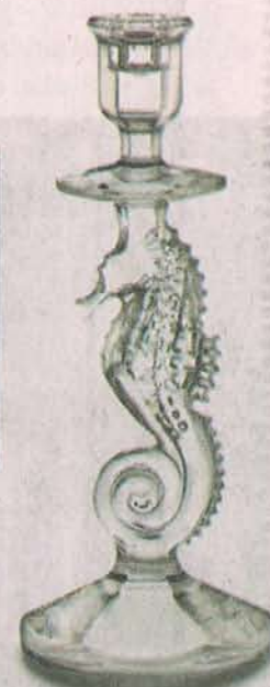
Waterford crystal seahorse candlestick; $175 at Waterford, (866) 714-0592, waterford.com.